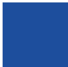
Patriotic Blue Fusion All-In-One®